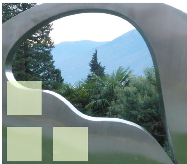
at a corner of the course venue

Hodgkin's disease, Liver Tumors, Neuroblastoma, Soft Tissue Sarcoma and Wilms tumor.