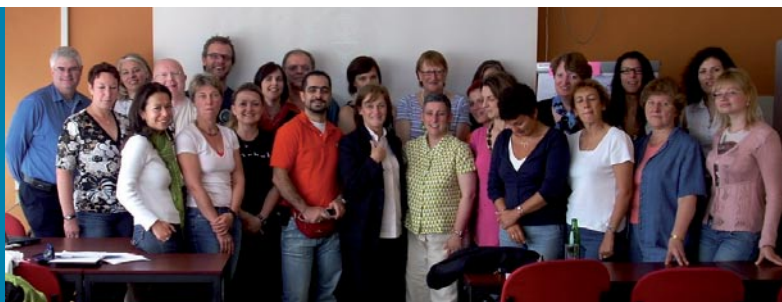
Group photo, taken during the third project seminar, 13-15 June 2008, Prague (CZ)

For further information please contact the SIOPE office at: office@siope.eu