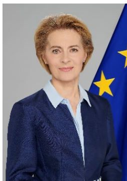
Ursula von der Leyen President of the European Commission

Ursula von der Leyen was Minister at federal level in Germany for more than 14 years and responsible for family, then labor and social affairs and later defence. In 2019, she was elected as President of the European Commission. As the head of the European executive, she has defined six headline ambitions for Europe for her mandate: a European Green Deal, a Europe fit for the digital age, an economy that works for people, a stronger Europe in the world, promoting our European way of life, and a new push for European democracy.