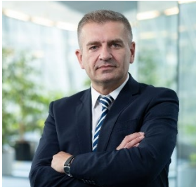
Bartosz Arłukowicz MEP (EPP, PL) BECA Chair

Paediatrician, Polish Health Minister in years 2011-2015, Member of the European Parliament. Chair of the Special Committee on Beating Cancer in the European Parliament. As a Health Minister he introduced a comprehensive reform of the system of oncological treatment and care in Poland.