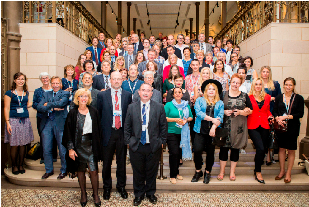
Figure 1 - SIOPE Partners agreeing to the idea of a Strategic Plan for Paediatric Oncology at the SIOPE-ENCCA Conference in 2014

Given this unacceptable situation, the European paediatric haemato-oncology community – represented by the European Society for Paediatric Oncology ( SIOPE ) – agreed that a consensus-based long-term plan would be needed to increase the cure rate and the quality of long-term survival of children and young people with cancer by 2025.