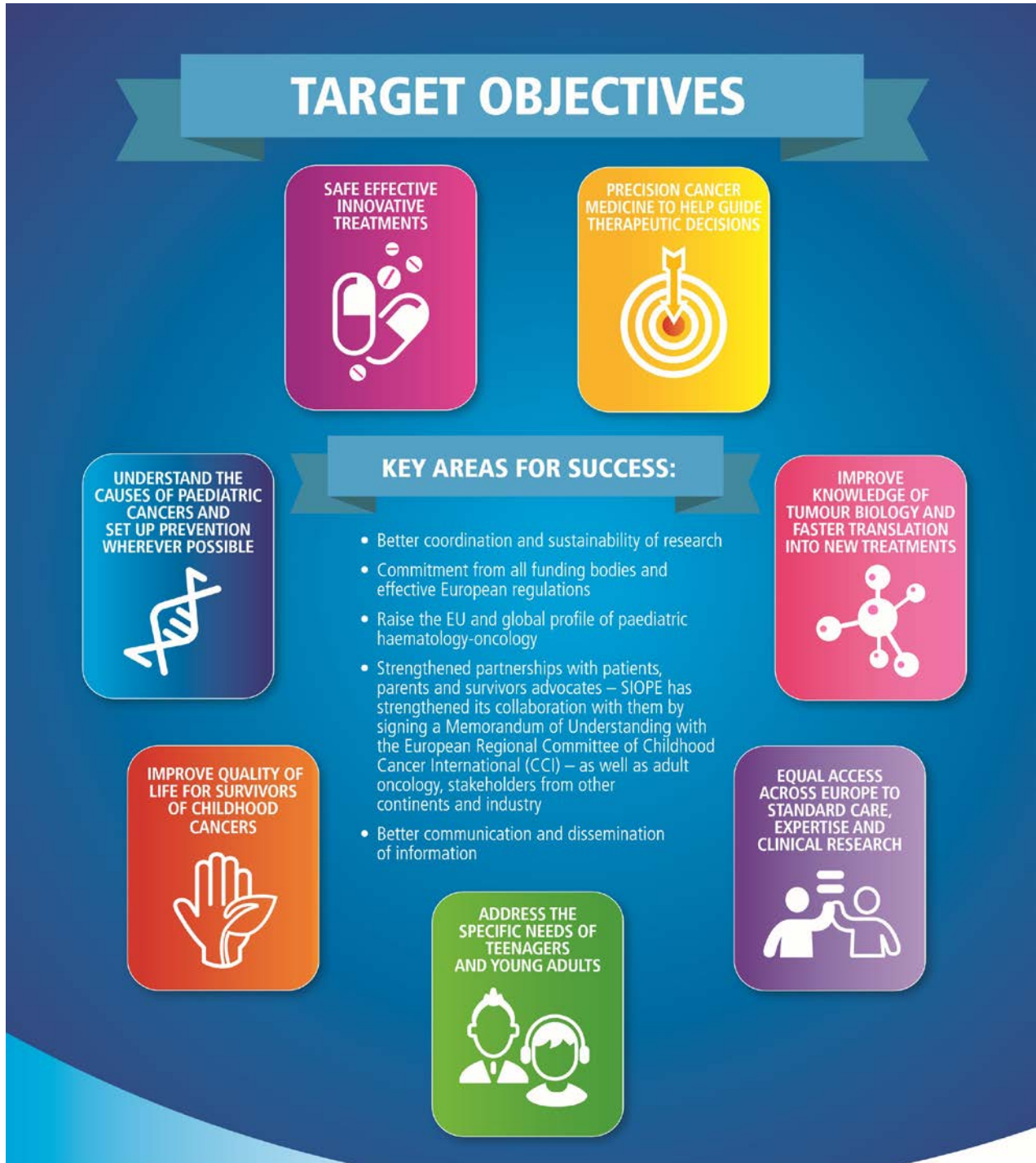
Figure 2 – A visual representation of the Plan’s 7 Objectives